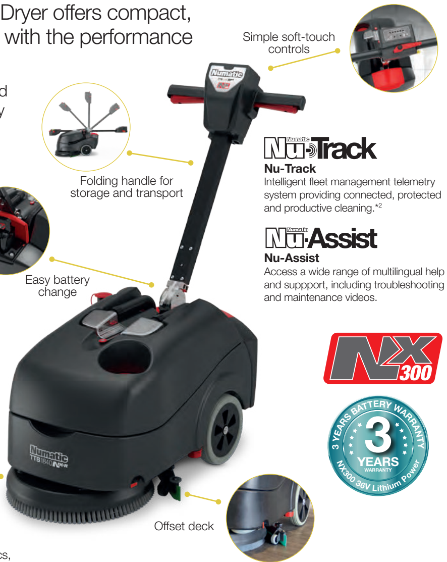
Simple soft-touch controls

New NX300 36V Battery Technology delivers 300Wh energy storage capacity with 60mins runtime, delivering consistent, powerful cleaning.