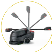
Folding handle for storage and transport