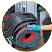
Simple pad/brush change