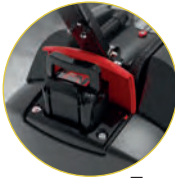
Easy battery change